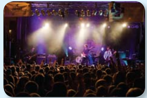
5,500+ watched Third Eye Blind raise the roof for healthcare.

More than 5,500 music lovers learned what it means to “Power Up the Purple Pod” and support the working uninsured in our community at Band Together’s annual charity concert on May 7 in Downtown Raleigh. With many concert-goers dressed in purple attire, and the stage bathed in a purple light show, the event helped raise more than $470,000 for Alliance to provide staffing for an existing health care pod (that is purple) in order to better serve the working uninsured of Wake County. The funds from this event will decrease new patient wait time, increase our patient base by 1,500 and increase patient visits each year by 3,000. Alliance is also piloting new programs in the purple pod that will add to the capacity of the clinic, the goal of this year’s event.