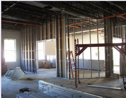
The "studs" have arrived!