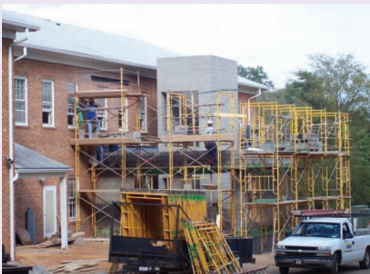
The new AMM entrance begins to take shape.